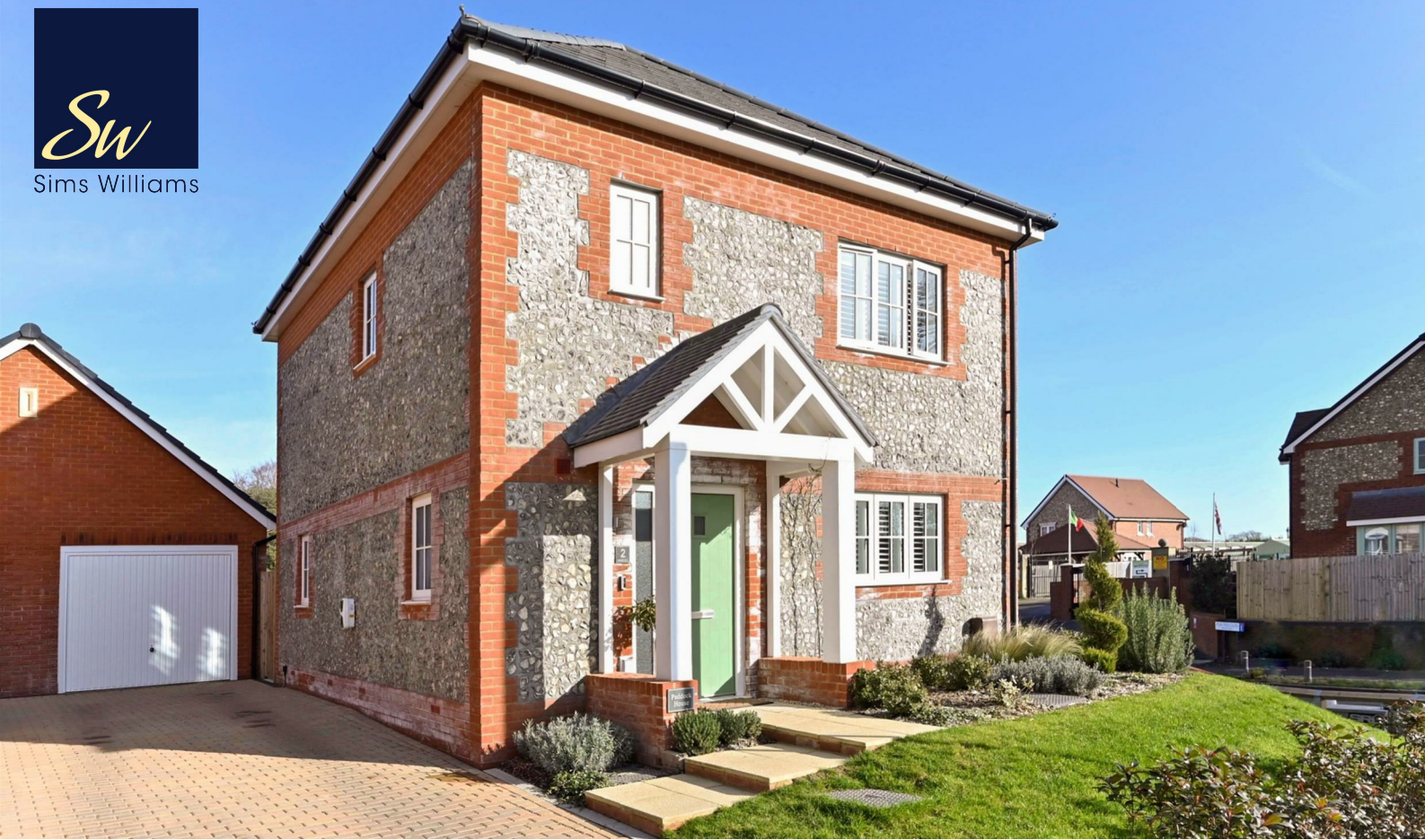
PADDOCK HOUSE, 2 ROEMead DRIVE, YAPTON, WEST SUSSEX, BN18 0ZE